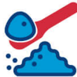
Cat litter coffee grounds